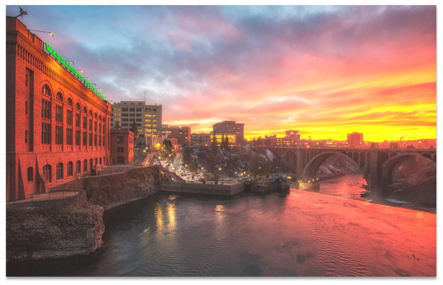
Upper Falls, Spokane, Wash.